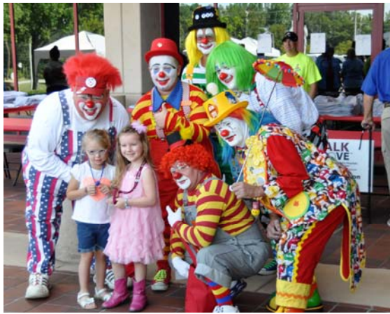
It's all about the kids—Love to the Rescue Clowns and Patient Ambassadors having FUN!