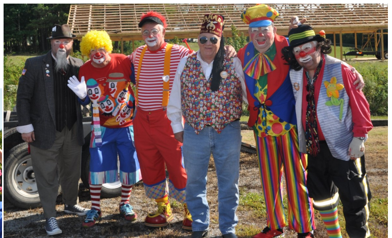
Cotton, Chi Chi, Patches, Shamrock, Skeeter and Razzel Mule Day Parade in Ider Alabama

Patches, Buggy, and Skeeter at Ider Mule Day.