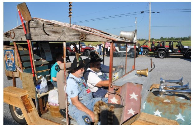
Termite Sedan about to go to town