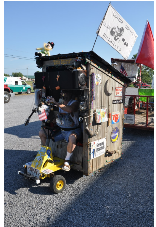
First Class Accommodations