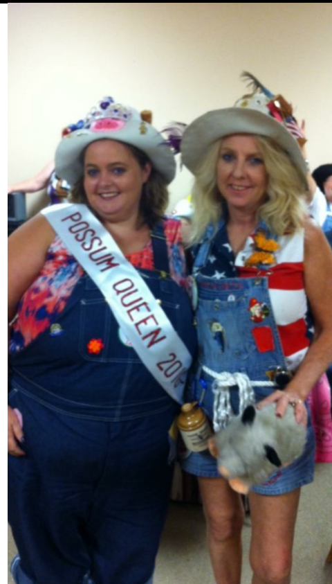
Incoming and Outgoing Cahaba Hillbilly Club Possum Queens