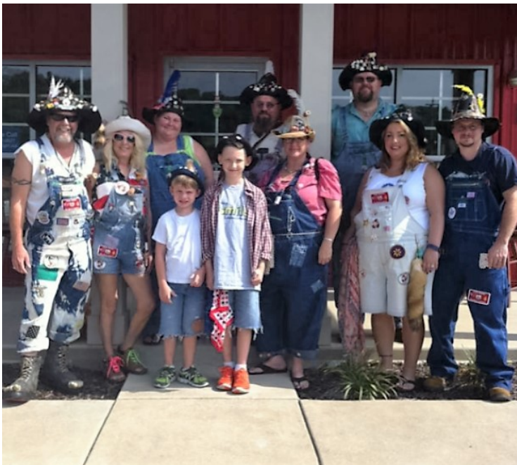
Them thar Hillbillies surenuf know howta have fun!