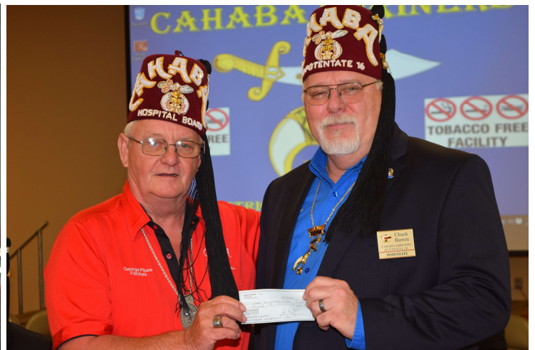
Donation to Transportation Fund From Bingo Committee