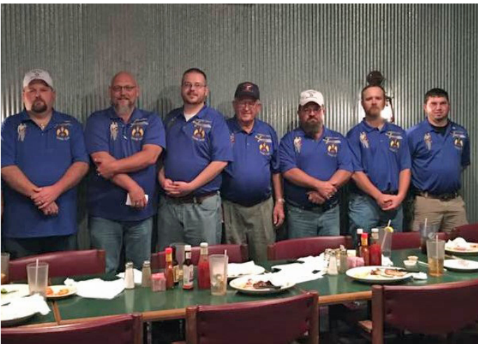
Lawrence County Shrine Club

Everyone have a very special summer, full of wonderful memories. Please do not forget our hospitals full of