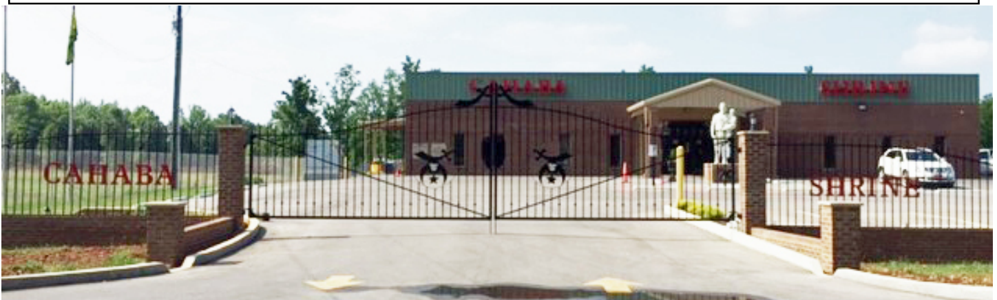
Our New Front Entrance and Gate to the Shrine Center Grounds