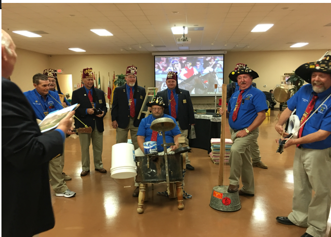
Hillbilly Band at Ceremonial

Tickets are $10 each or six for $50 and are available through the Shrine Office at (256) 851-7400