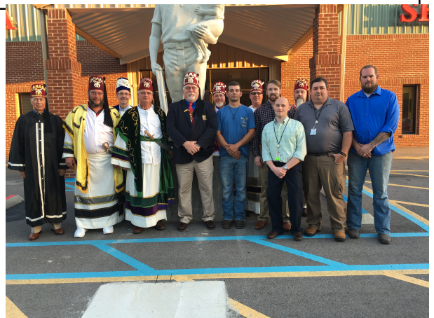
Spring Ceremonial at Cahaba Shrine Center