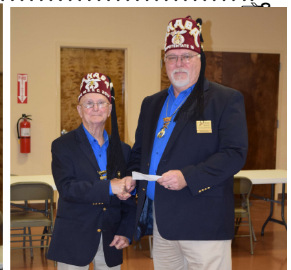
Muscle Shoals Donation