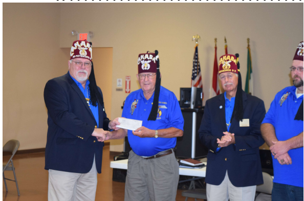
Temple Donation to Lawrence County SC