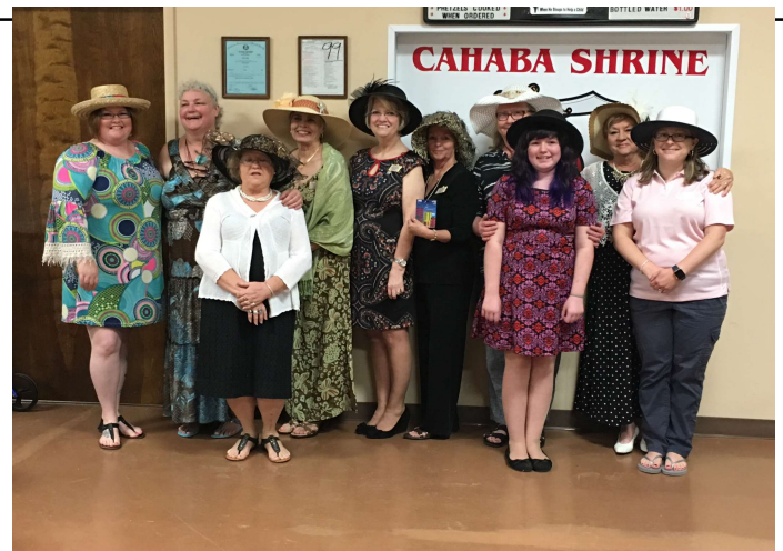
The Derby is on!