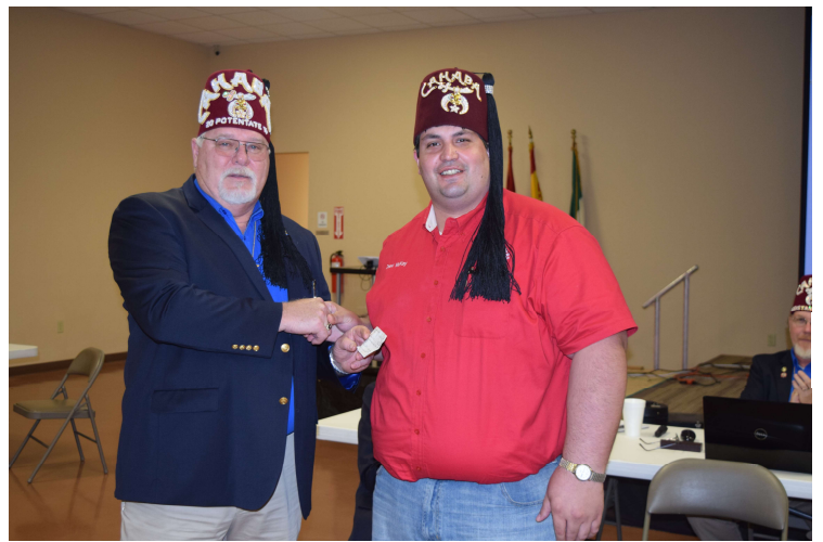
Swinging at Dixie