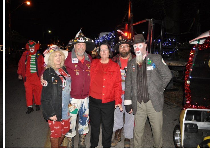
Tis the Season - Dutton and Decatur Christmas Parades