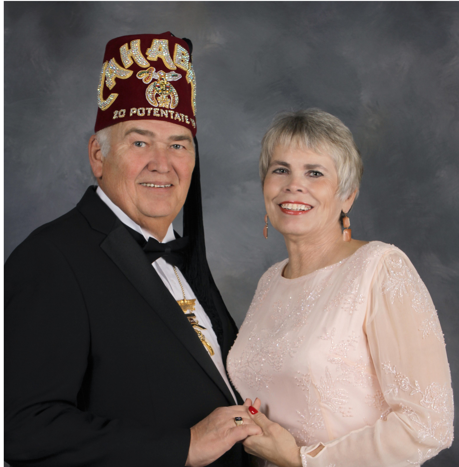
All Aboard - The Fun Train is leaving the station!