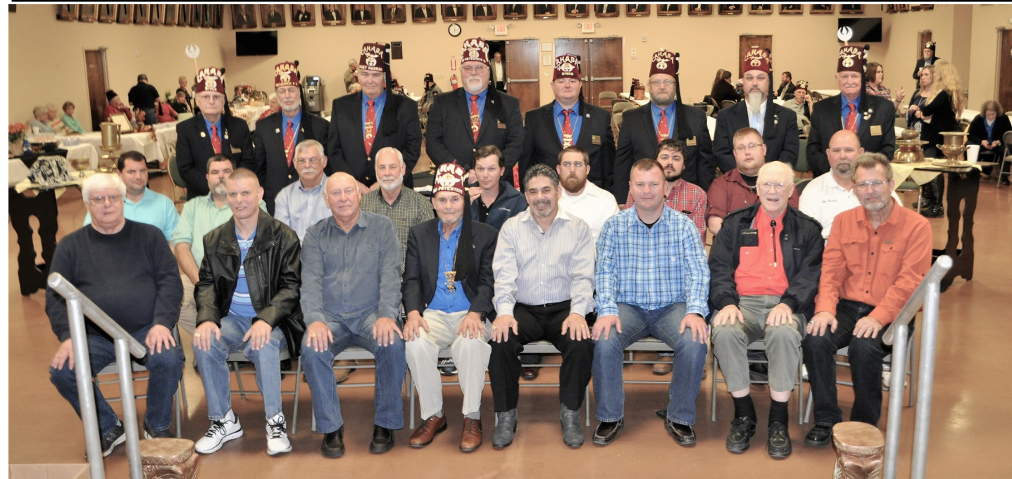
2016 Fall Ceremonial - Class Picture

If there's ever anything I can do for you, just give me a call at 256-605-9364. Happy New Year Cahaba!