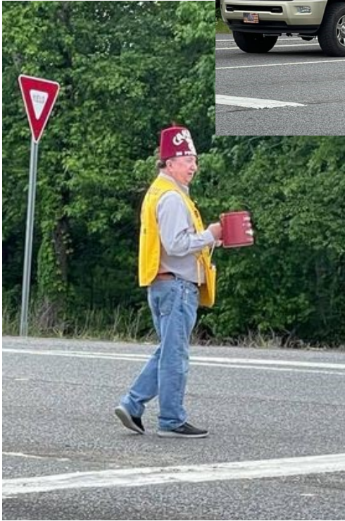
Palm Sunday Paper Crusade underway! Our Potentate and Recorder collecting for the Paper Crusade.