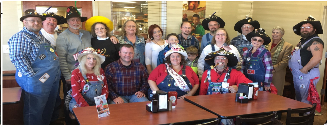
Hillbilly Unit—Them Thar Folks dresses up purty