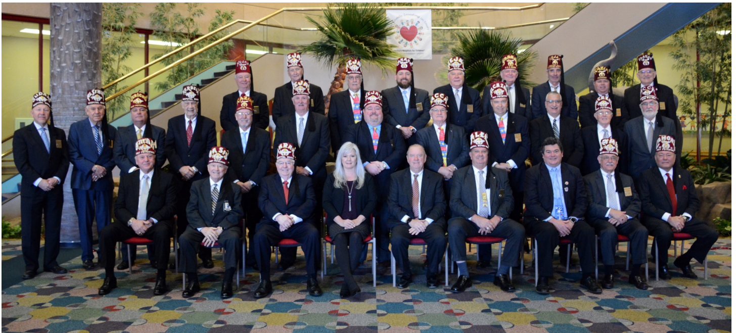
Shriners Hospital for Children Greenville S.C - Board of Governors SHC Greenville 2017